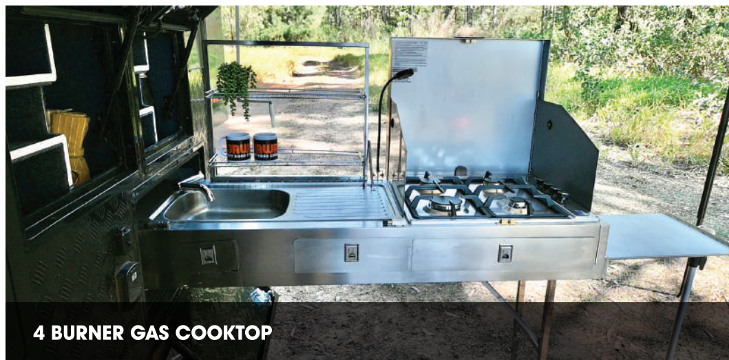
4 BURNER GAS COOKTOP