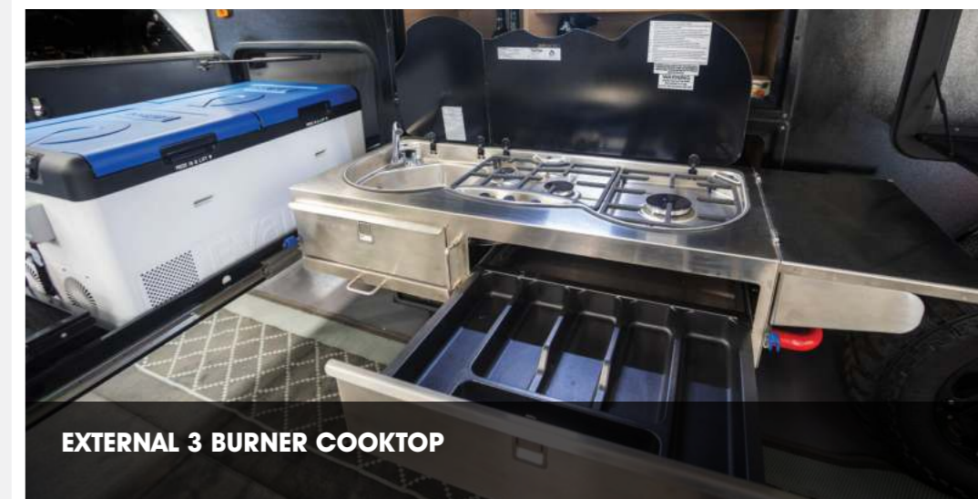
EXTERNAL 3 BURNER COOKTOP