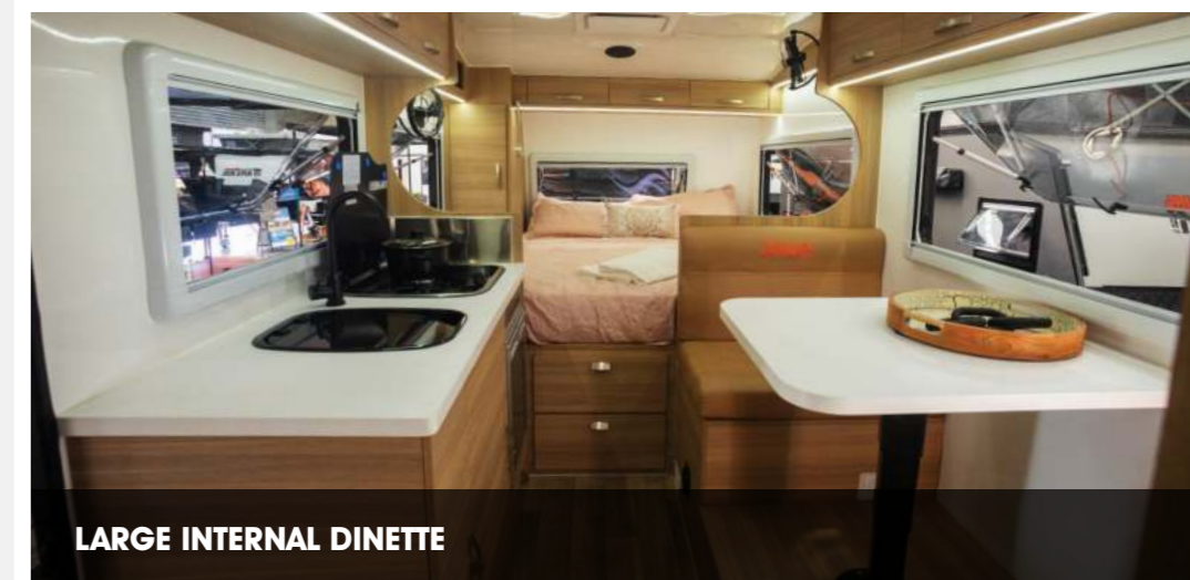
LARGE INTERNAL DINETTE