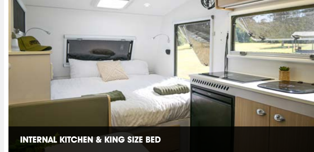
INTERNAL KITCHEN & KING SIZE BED

Tare Mass: 2525kg Ball Weight: 175kg ATM: 2990kg Size: L-7020 x W-2440 x H-3010mm Drawbar: 150 x 50 x 4mm (Q345 Steel)