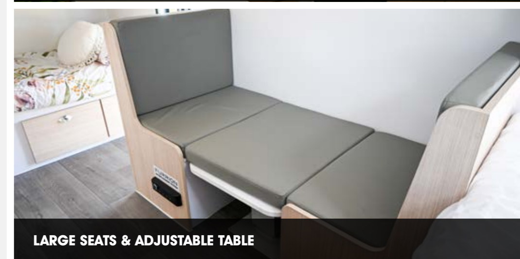
LARGE SEATS & ADJUSTABLE TABLE